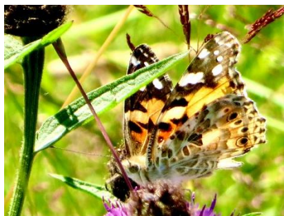
Painted Lady on The Hook in 2022

The other species recorded, in smaller numbers, are: Green Veined White, Large Skipper, Essex Skipper, Red Admiral, Common Blue, Brimstone and Painted Lady.