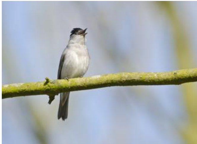
The Blackcap has a lovely fluting call

Have you ever got up really early in late spring to listen to the Dawn Chorus? It's a really special experience, with bird song breaking through the chill of the morning air as the birds call to establish territory and attract a mate.