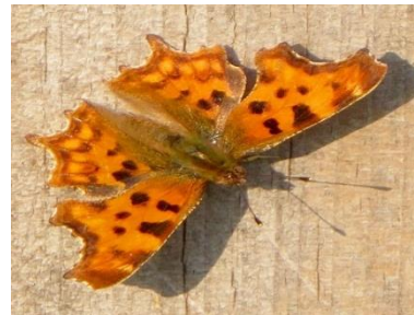
A Comma, sunning itself on the bench near the pond

The species that we have recorded in the greatest numbers over the 3 years (starting with the most numerous) are: Small White, Large White, Orange Tip, Ringlet, Gatekeeper, Speckled Wood and Small Tortoiseshell. There are also reasonable numbers of Peacock, Comma, Small Skipper, Meadow Brown and Holly Blue.