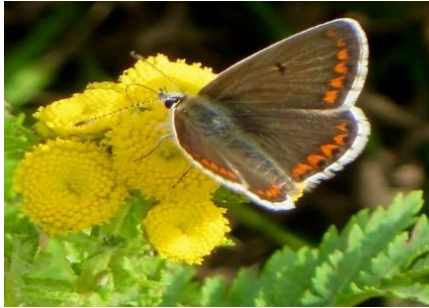
Brown Argos on The Hook in 2022

The 2 species that were new to us in 2022 were the Small Copper and the Brown Argos.