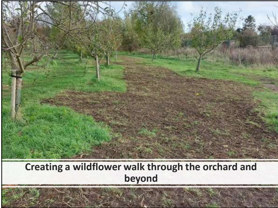
Creating a wildflower walk through the orchard and beyond