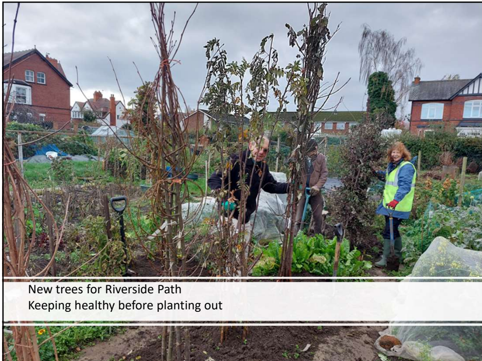
New trees for Riverside Path Keeping healthy before planting out