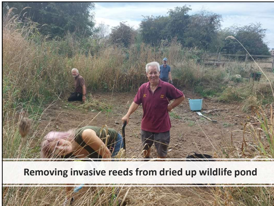
Removing invasive reeds from dried up wildlife pond